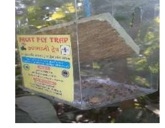
Collection of male fruit fly in trap